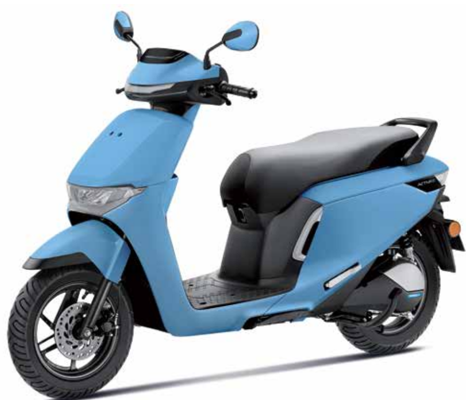
Pearl Serenity Blue